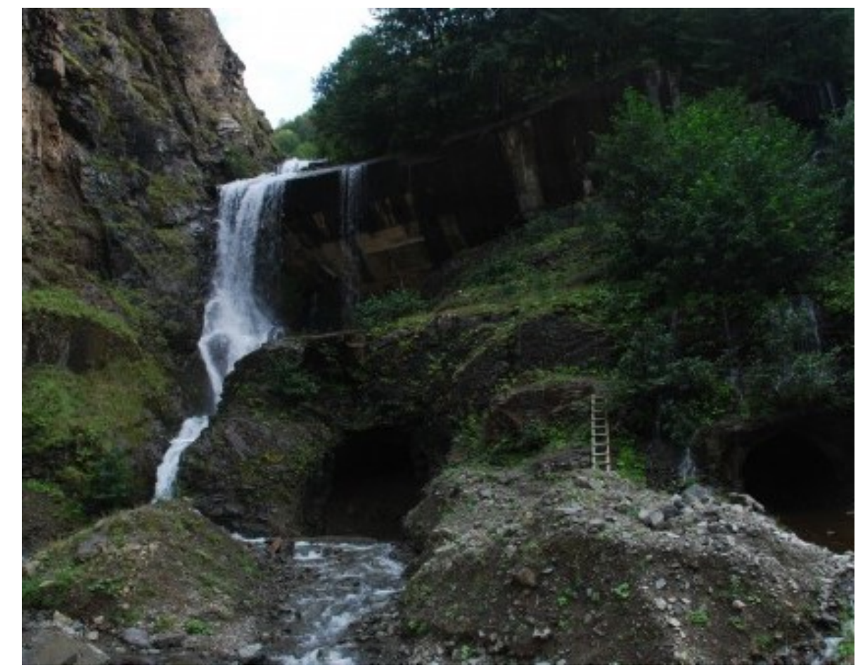
Khudoni project