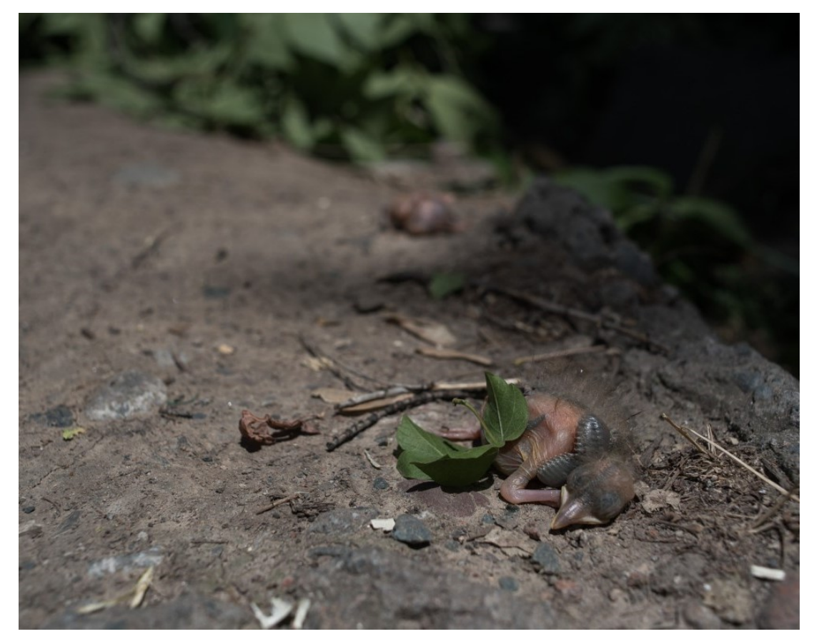
After cutting trees in Bishkek, photo - Danil Usmanov/Kloop.kg