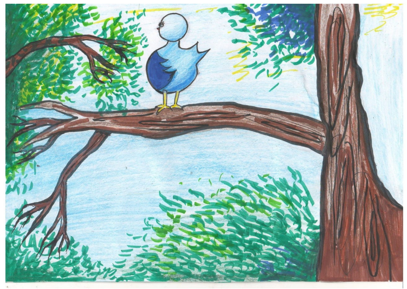
Radiohead, Burn the Witch

Ecoforum of NGOs of Kazakhstan: to be inserted