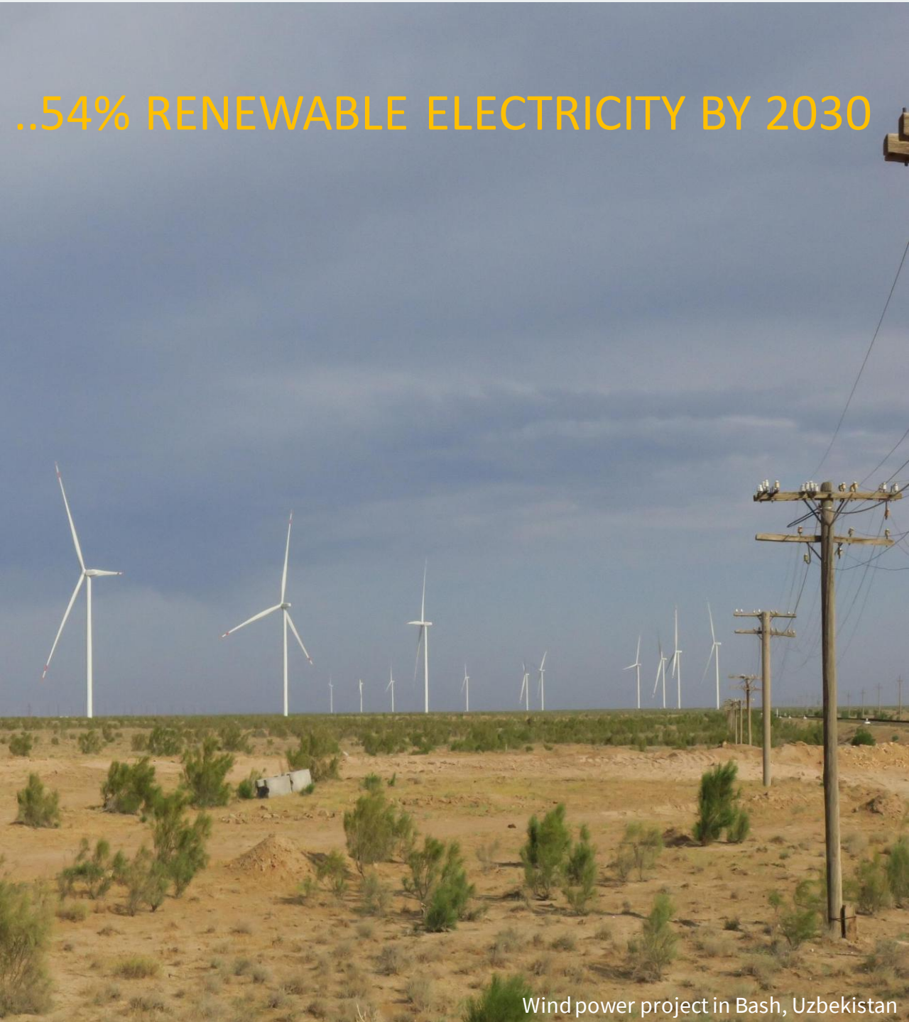
Wind power project in Bash, Uzbekistan