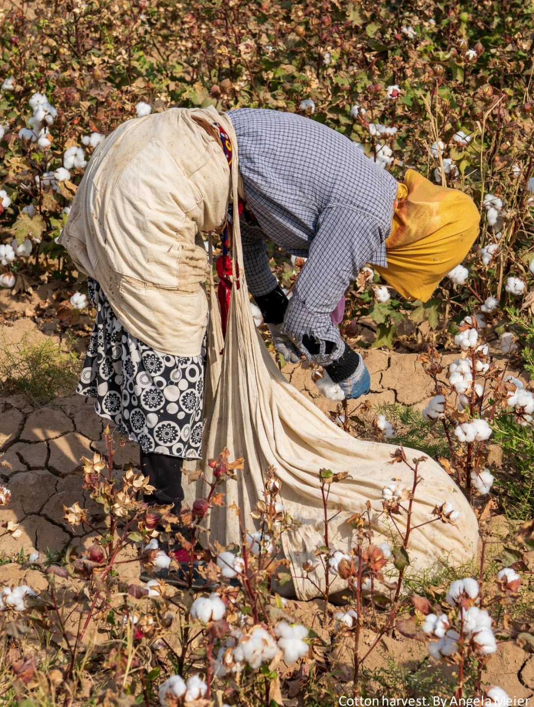
Cotton harvest. By Angela Meier