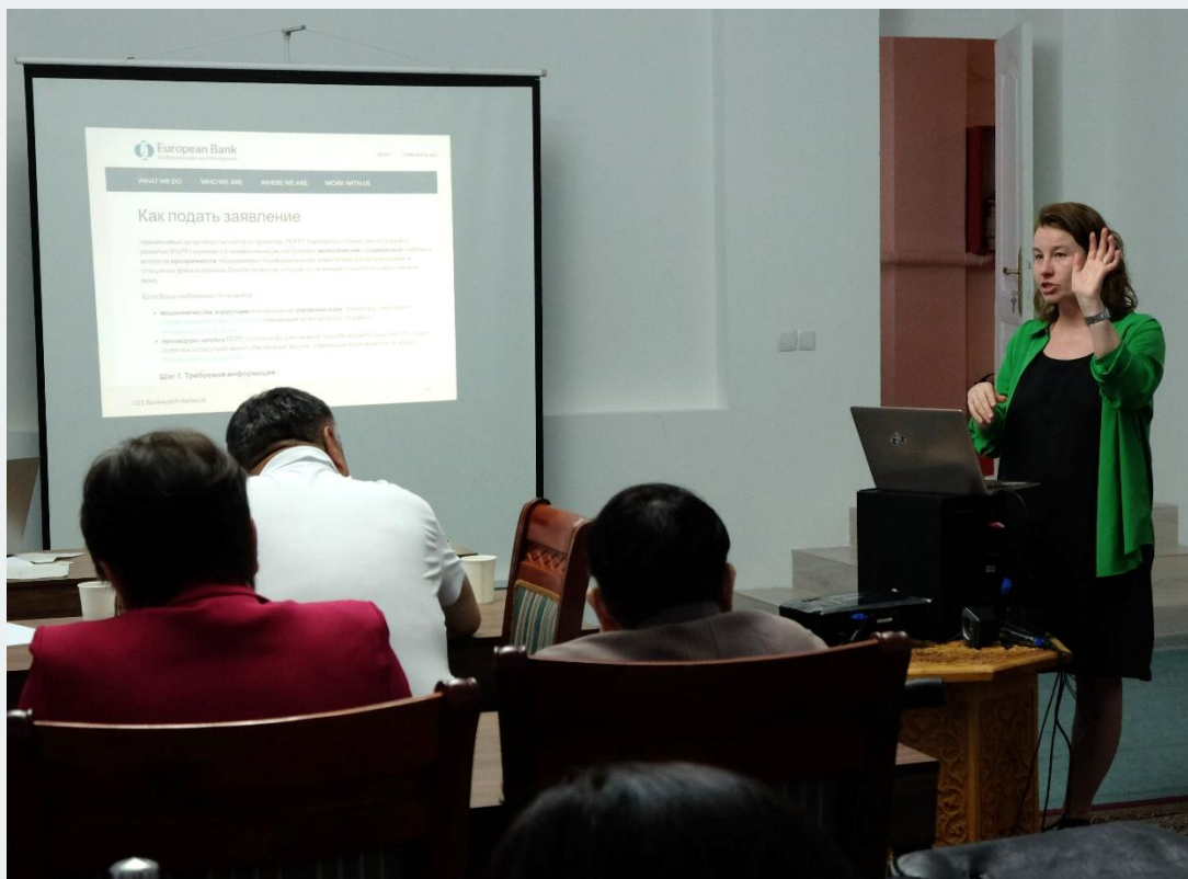
Bankwatch capacity building event during the EBRD AGM in Samarkand in 2023