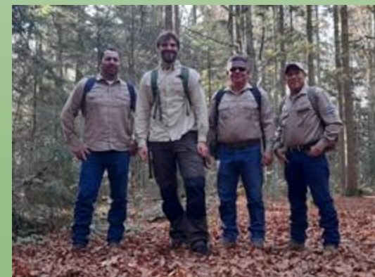
Partnership Germany-El Salvador