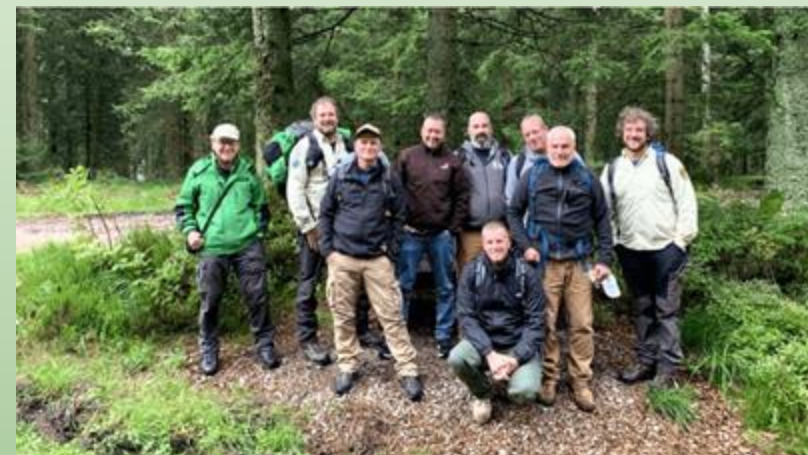
Twinning Project Germany-Israel