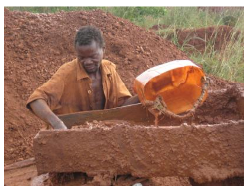
Fig 1. Individual miner re-sluicing tailings