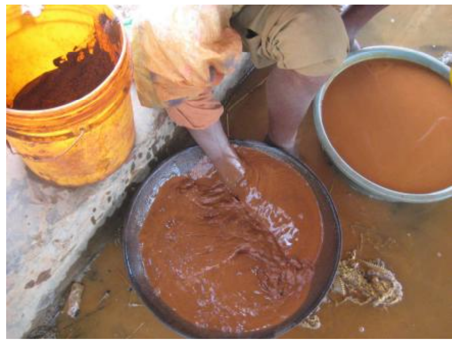
Fig 4. Gold ore amalgamation in ore processing pond