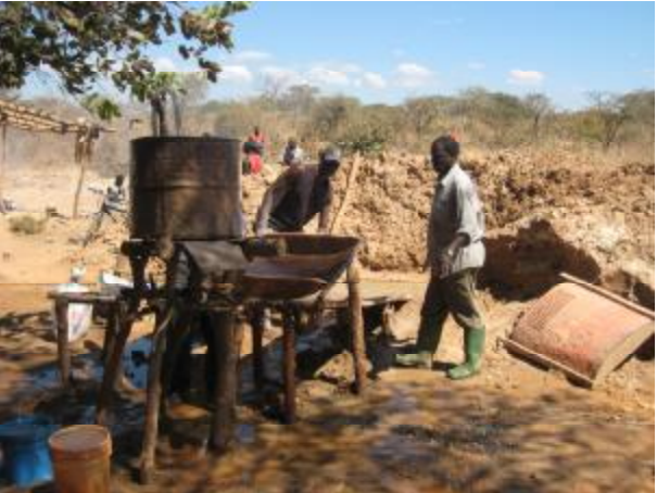
Fig 3. Gold ore sluicing by using constant flow employing the siphon method at Makongolosi mining center, Mbeya Region