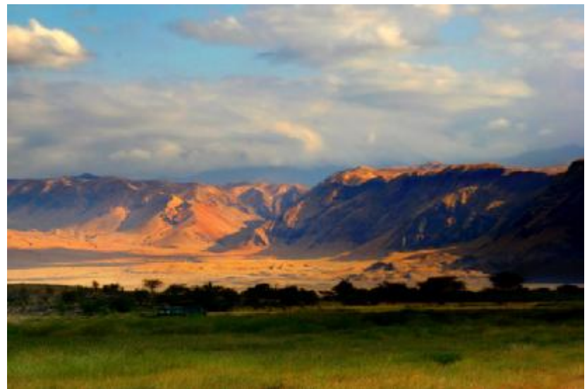
Report by Agenda, Arnika Association and IPEN January 2013