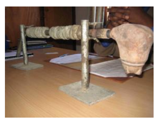
Fig 10 and Fig 11. Locally made metal retorts that owned by artisanal and small scale miners