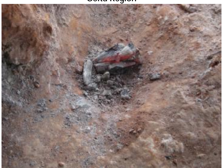
Fig 7. Open burning of gold – mercury amalgam