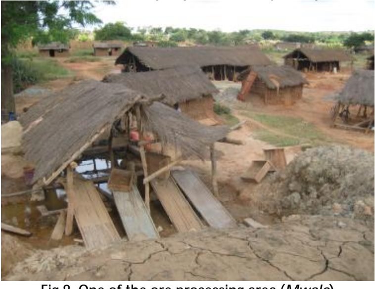
Fig 8. One of the ore processing area (Mwalo)