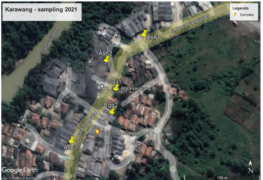
Figure 1: Map with group of samples in the middle of lime kilns concentrated around the road, locality Karawang II.

The identification and quanti-fication of PBDEs were performed using gas chromatography coupled with mass spectrometry in negative ion chemical ionisation mode (GC-MS-NICI). The identify-cation and quantification of HBCD isomers and selected PFASs performed were by liquid chromatography interfaced with tandem mass spectrometry with electrospray ionisation in nega-tive mode (UHPLC-MS/MS-ESI).