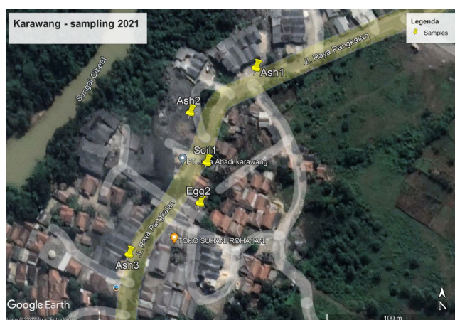
Figure 1: Map with group of samples in the middle of lime kilns concentrated around the road, locality Karawang II.

The residual ash from lime kilns and/or ash dumped nearby, and soil samples, all of which were accessible to chickens foraging, were taken. These were also pooled samples from 5 point samples. Soil was taken at a depth of 2 to 10 cm from the surface by a stainless steel shovel. Samples were homogenized in a stainless steel bowl. They were transported in 250 ml PE plastic containers to the laboratory and kept in cool conditions during storage and transportation.