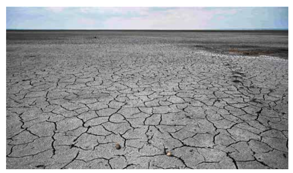
Photo 3.2: Area where sample L4, near the Malokaterynivka village, was taken on 14-th of July 2023.