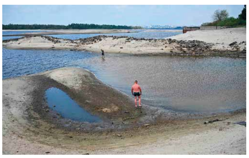
Photo 3.1: Area where sample L3 in Zaporizhzhia, near the sailing school, was taken on 14-th of July, 2023.

The concentrations of PFASs in the five analysed sediment samples in this study were generally low, with only a few instances exceeding the limit of quantification (LOQs).<sup>8</sup>