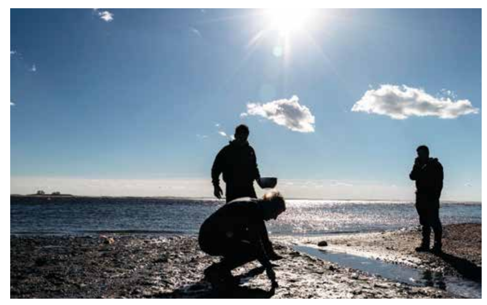
Photo 3.5: Sampling on Dnipro riverbank near Bilenke village in 2023.

magnitude higher than both the Berezinskyi (up to 0.011 mg/kg dm) and Druzhnyi (0.023 mg/kg dm) reference sites (Nezhyba et al. 2012). Similarly to Zaporizhzhia, the maximum concentration of mercury in the sediments of the Dnipro and Boh Estuary (Burgess et al. 2011) was relatively high compared to the other sites under examination.