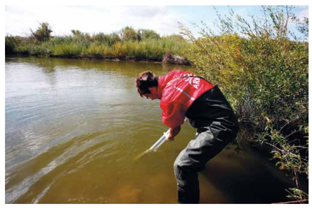
Photo 3.8: Sampling of sediments from Nura River in Kazakhstan in August 2013.

2015 Arnika study (Petrlik et al. 2015). This indicates that PCB concentrations are not exceptionally high compared to European and non-European river locations.