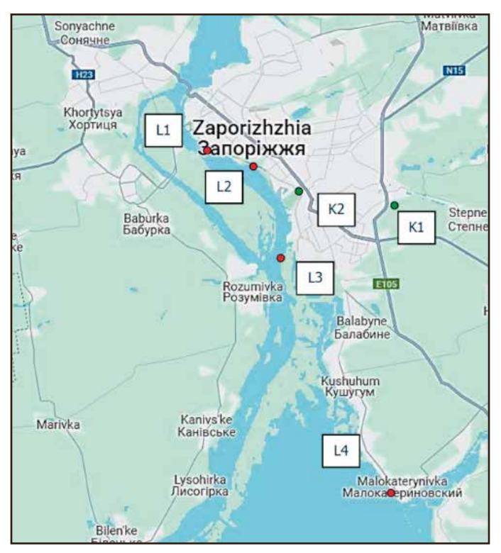
Figure 2.1: Map of the locations in Zaporizhzhia area (sampling in 2024).

Sampling locations are marked in maps at Figures 2.1, 2.2 and 2.3, and their characteristics can be visible also at Photos 2.1 - 2.7 attached to descriptions below.