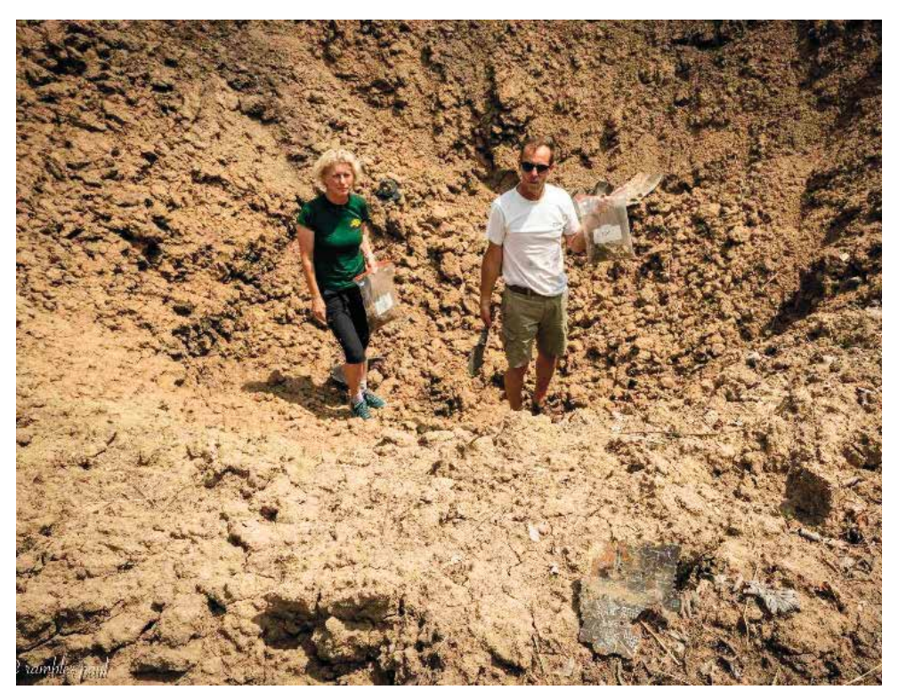
Photo 2.5: Site K1 Crater near Orihivske road