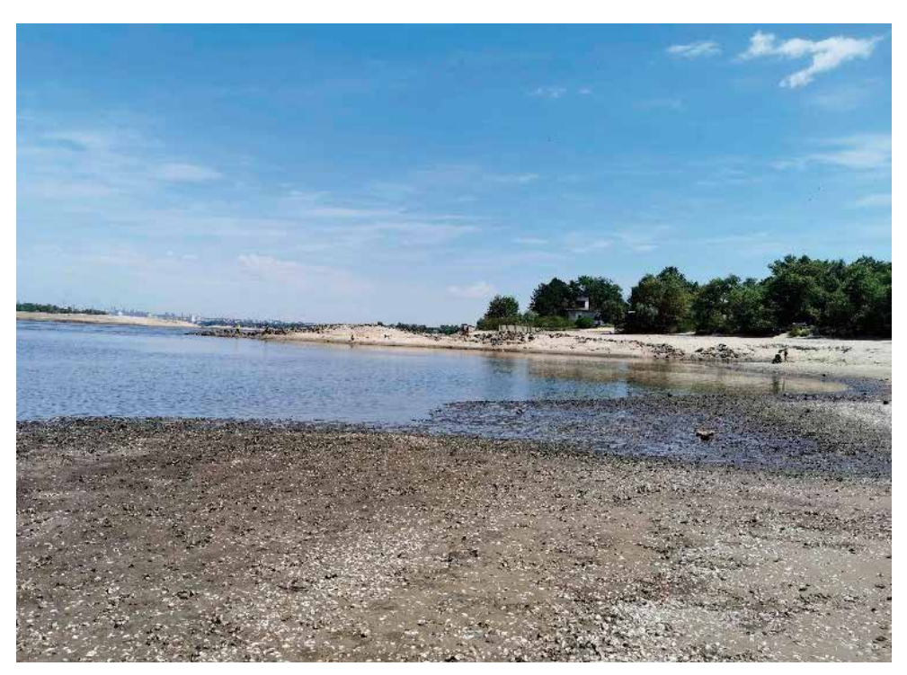
Photo 2.3: Site L3 Zaporizhzhia Sailing school