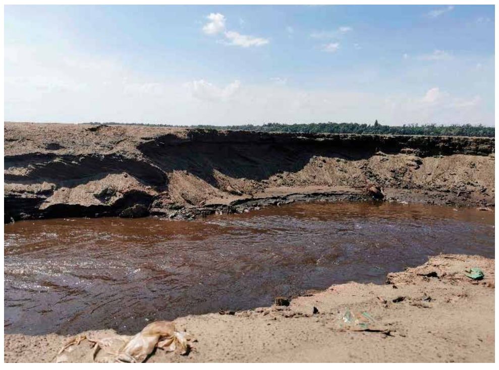
Photo 2.2: Site L2 Zaporizhzhia - Sukha Moskovka

The Central city beach is the largest recreation area in Zaporizhzhia and in the past was actively used by local residents during the summer season. Near the beach, after the water level dropped because of the explosion at the Kakhovka reservoir, three sewage pipes of the local water supply were exposed (see Photo 3.4). Zaporizhzhia Regional Infectious Disease Hospital is also nearby. It is impossible to accurately determine all enterprises that discharge wastewater in this area because there is a strong suspicion of the illegal connection of enterprises to the local sewage systems. Sample SED-U-2 was taken from the same locality but due to presence of water in the sampling spot, it was not possible to take the sample from the exact same place.