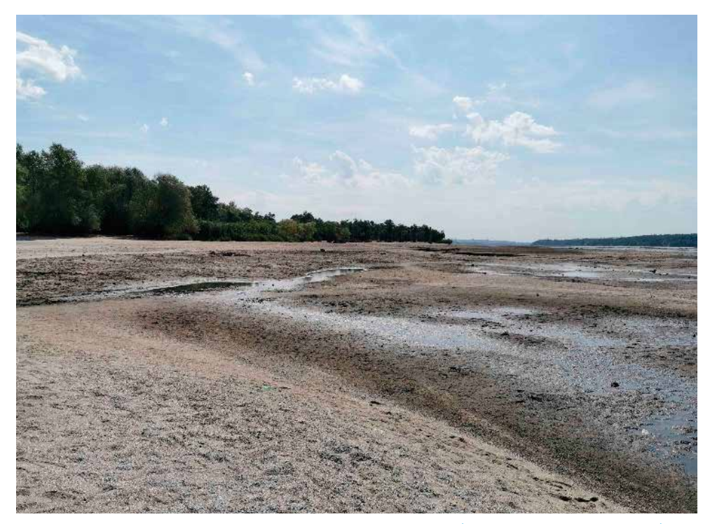
Photo 2.1: Site L1 Zaporizhzhia – Central city beach