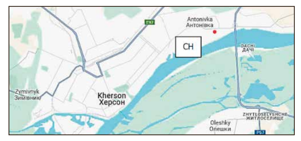
Figure 2.3: Map with marked location of sample CH in Kherson.

The sampled site is situated in the Industrial district (Zavodskiy district) of Zaporizhzhia, specifically on Leitenanta Shmidta Street near Pavlo-Kichkas beach. This area lies within proximity to the Dnipro River and is characterized by its industrial surroundings juxtaposed with a natural beach environment.