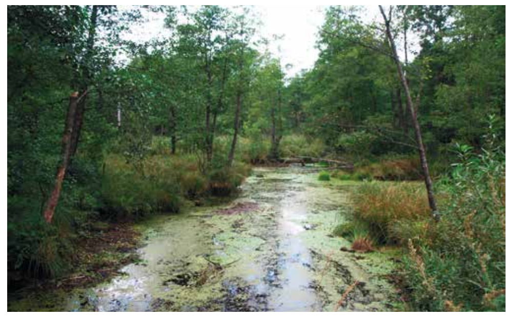
Photo 3.3: Berezinsky reference site in upper part of Dnipro basin in Belarus, where sediment sample was taken on 20-th of August 2012.