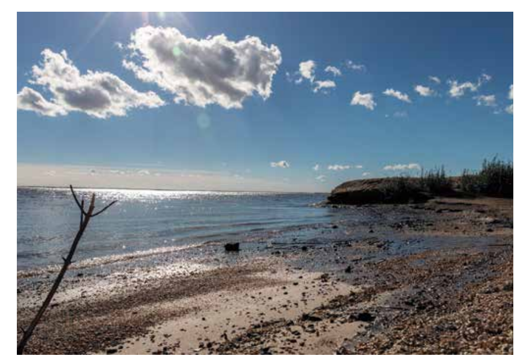
Photo 3.10: Dnipro river near Bilinke village.

The high concentrations of other substances in sediments suggest that the source could be heavy industry, whether metallurgical or engineering. Elevated concentrations of arsenic may be related to coal combustion or the use of materials with a high arsenic content. Further research in Zaporizhzhia should also focus on these sources.